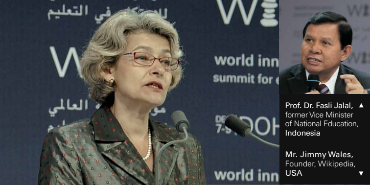
▲ Ms. Irina Bokova, Director-General, UNESCO