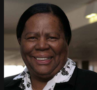
Her Excellency Naledi Pandor, MP, Minister of Science and Technology, South Africa