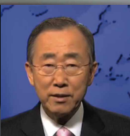
▲ Mr. Gordon Brown, Member of Parliament, former Prime Minister, UK