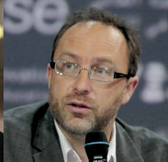
Mr. Jimmy Wales, Founder, Wikipedia, USA ▼