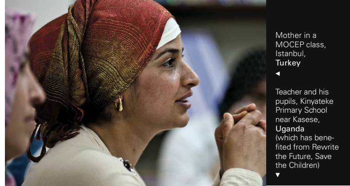
Mother in a MOCEP class, Istanbul, Turkey

- The WISE Program for Education Leadership helps prepare newly appointed education leaders for their future challenges and responsibilities.