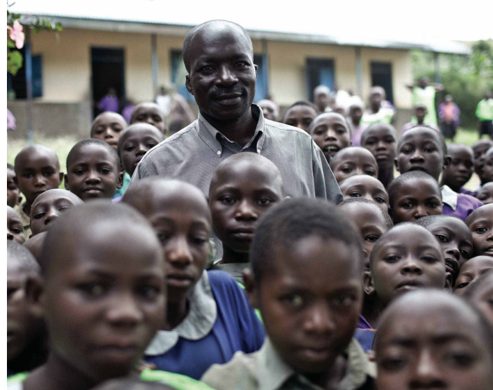
Teacher and his pupils, Kinyateke Primary School near Kasese, Uganda (which has benefited from Rewrite the Future, Save the Children)